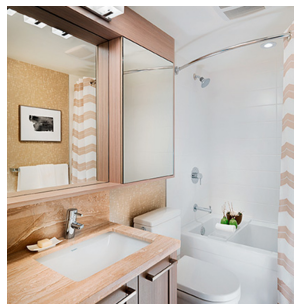
PARK 586 - 588 SF