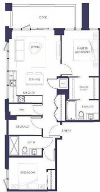
7 Bath + 7 Bath

Listed By: Sutton Group-West Coast Realty