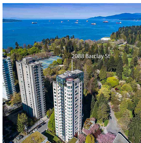
2088 Barclay St