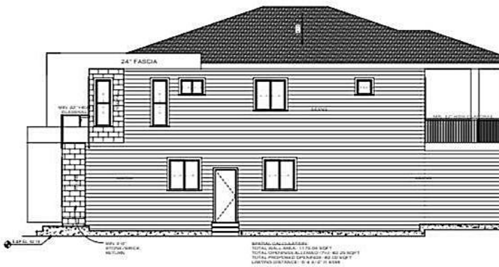
Figure Elevation 1/4" = 1'-0"