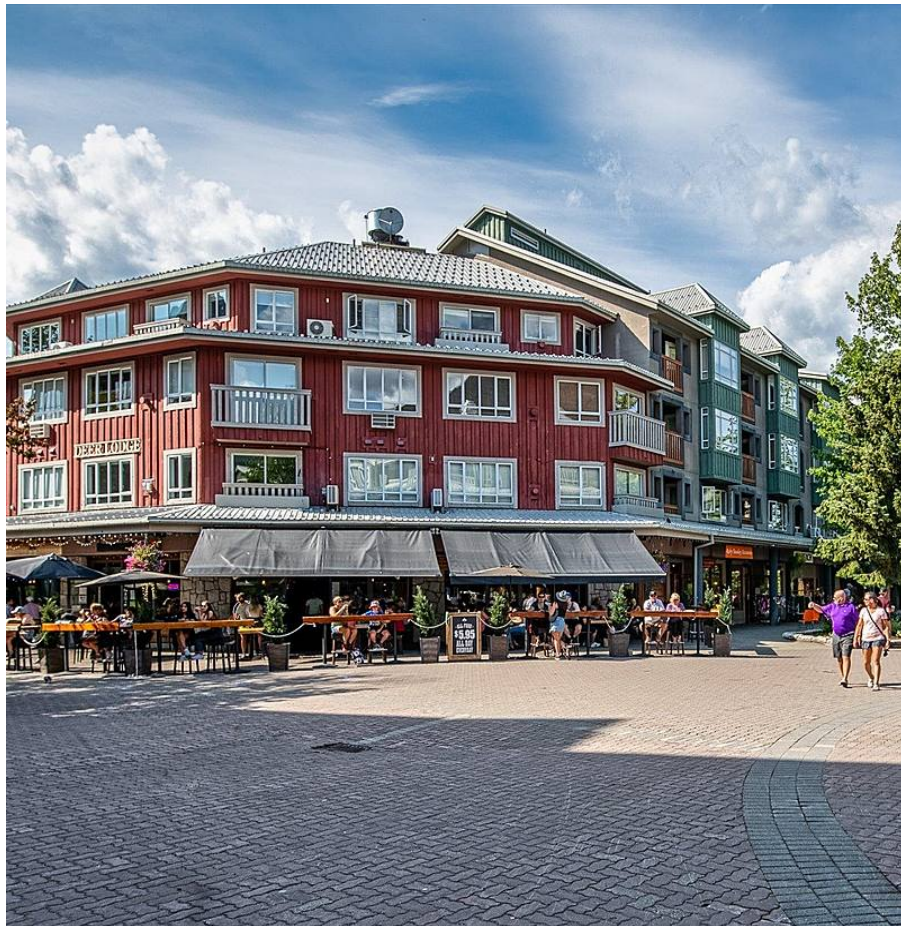
Image owning in the heart of Whistler Village! This is your chance to own this top floor fully renovated one bedroom in Deer Lodge, Whistler Town Plaza. Complete with stainless steel appliances & granite countertops in the kitchen, hardwood and carpet flooring, gas fireplace, luxurious bathroom, stacker washer & dryer and a deck to enjoy your morning coffee. Located within walking distance to Whistler's amazing dining, shopping and skiing. Zoned for nightly rentals or personal use the choice is yours.