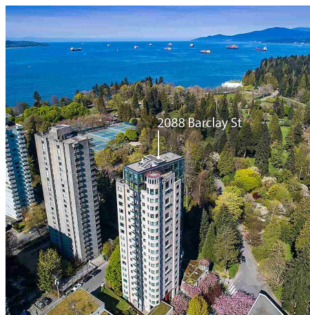
2088 Barclay St