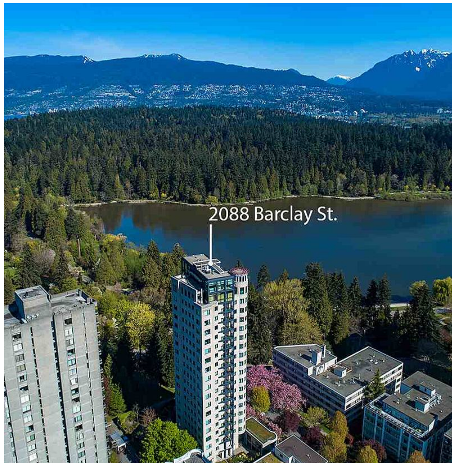
2088 Barclay St.