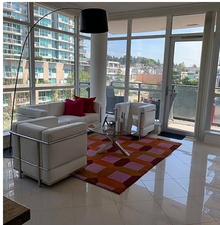
Total Sq. Ft. 899 Plus Balcony 183 Sq. Ft. Measurements are approximate, and no trade should be verified by purchasers.