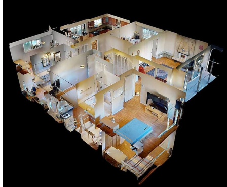
erport 3D Walkthrough Tour Avail