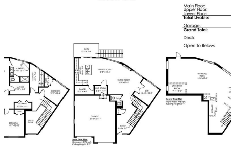
4-46379 Uplands Rd, Chilliwack

Main Floor: Upper Floor: Lower Floor: Total Inhabitable: Garage: Grand Total: Deck: Open To Below: