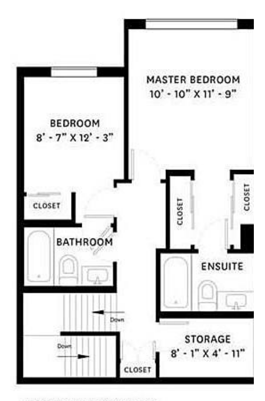
UPPER FLOOR PLAN Ceiling Height: 8' - 0"

Brand new 3 Bedroom Townhome in Pinnacle on the Park. This is city living at its finest! This home offers an open efficient floor plan with chef's kitchen, 1 bedroom and powder room on main level; upstairs with decent size master and 2nd bedroom and storage/den. Heat pump for cooling and heating comfort. Amenities include fitness centre, children's play area, party lounge with outdoor BBQ patio. Convenient location in the Olympic Village neighbourhood right across from the park, close to shopping, services, restaurants and rapid transit. Comes with 1 parking and bike storage. Ready to move in. Easy to show. Measured by professional, to be verified by buyers.