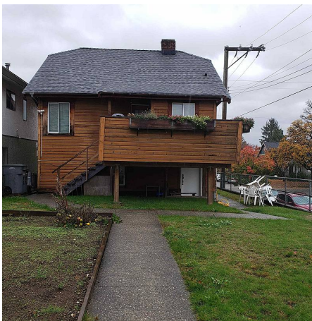
AVE E, VANCOUVER, V5N 2N7