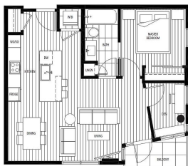
UNIT 205/305 1 BEDROOM + DEN INTERIOR 691 SF | BALCONY 40 SF