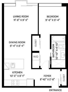
MAIN FLOOR PLAN Ceiling Height: 8'-5"