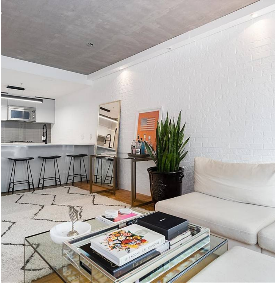
704 - 128 WEST CORDOVA STREET, VANCOUVER, BC