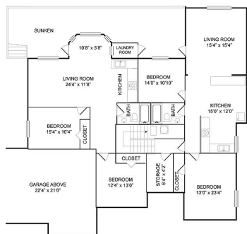
1 ST FLOOR :2,108 sqft