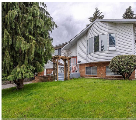
Front of Home | 32560 Murray Ave