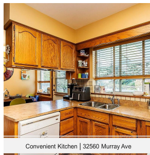
Convenient Kitchen | 32560 Murray Ave

SEE the MOVIE! Location Location, Location .. just 2-3 blocks to Mill Lake, 7 Oaks and West Oaks Shopping. No Hills Either! Yes Awesome Location it is, even Centennial Elementary School with it's Dual Track Program with French is a few blocks away. This home is located on a cul-de-sac street, so that means no -drive-through traffic and an extra secure neighbourhood. I challenge you, you will not get better neighbours and check out that everyone really maintains their yards. This 3 bedroom home has a 3/4 basement that could be suitable A Strong feature is the private backyard with the covered deck, shed & barbecue gas hookup. You'll also love the great 'Baker view and the quiet calm of this sought after cul-de-sac in the centre of the city.