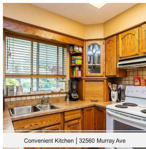
Convenient Kitchen | 32560 Murray Ave