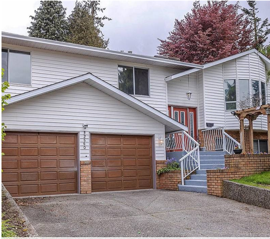
Front of Home | 32560 Murray Ave