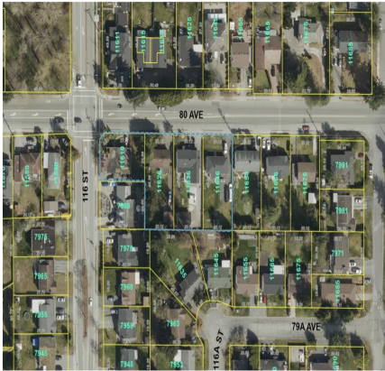
Data Accuracy Not Guaranteed. City of Delta

LAND ASSEMBLY! Sold as is where is as part of a Land Assembly In-conjunction with 11636/11626/11610 80 Avenue. Total Combined area 37,077sqft. Current Zoning RD-3 and Area Plan Designation ISF (ND). Buyers and their agents to do their own due diligence with the City of Delta/Architect.