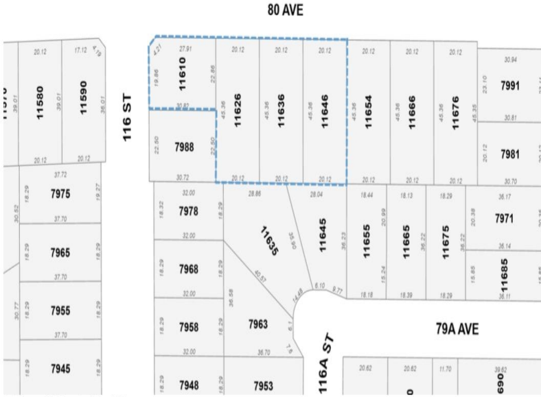
Data Accuracy Not Guaranteed. City of Delta