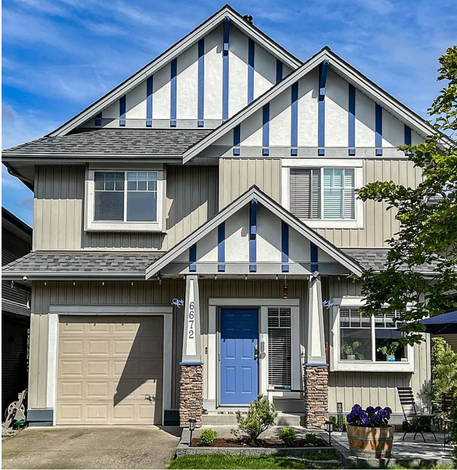
672 182A St. Surrey BC V3S 0N8

Beautiful 5 bedroom home in a quiet cul de sac location. Kitchen boast granite counter tops and a big island to host family gatherings. Upstairs features 4 good size bedrooms 2 baths, basement has a big bedroom full washroom and a kitchenette with microwave, sink and fridge. Backyard is private and an entertainers oasis with gazebo and good size deck and hot tub. All this and a block away from Adams Road Elementary and North Cloverdale west Park. 1 yr old Roof, fresh paint brand new washer/dryer.