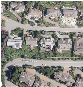
2398 Constantine Place, West Vancouver