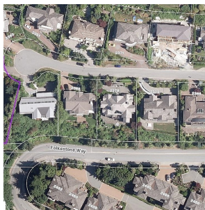
2398 Constantine Place, West Vancouver