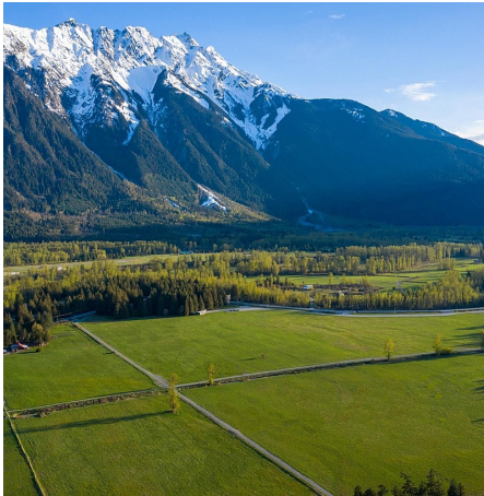
Lot 3C - Merlot Peak Drive 1,243 m 2 / 13,379 sf

Listed By: Whistler Real Estate Company Limited