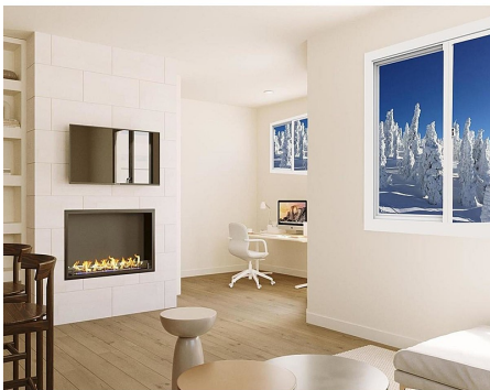
Floor plans, 3D models, and elevations are artist's renderings only, may not accurately represent the actual condition of a home and may contain options which are not standard on all designs. Acorn Communities LTD reserves the right to make modifications of equal or better value to plans, pricing, product design, specifications, fixtures, and features without prior notifications should necessary. E. & O.E.