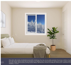
Floor plans, 3D models, and elevations are artist's renderings only, may not accurately represent the actual condition of a home and may contain options which are not standard on all designs. Acorn Communities LTD reserves the right to make modifications of equal or better value to plans, pricing, product design, specifications, fixtures, and features without prior notifications should necessary. E. & O.E.