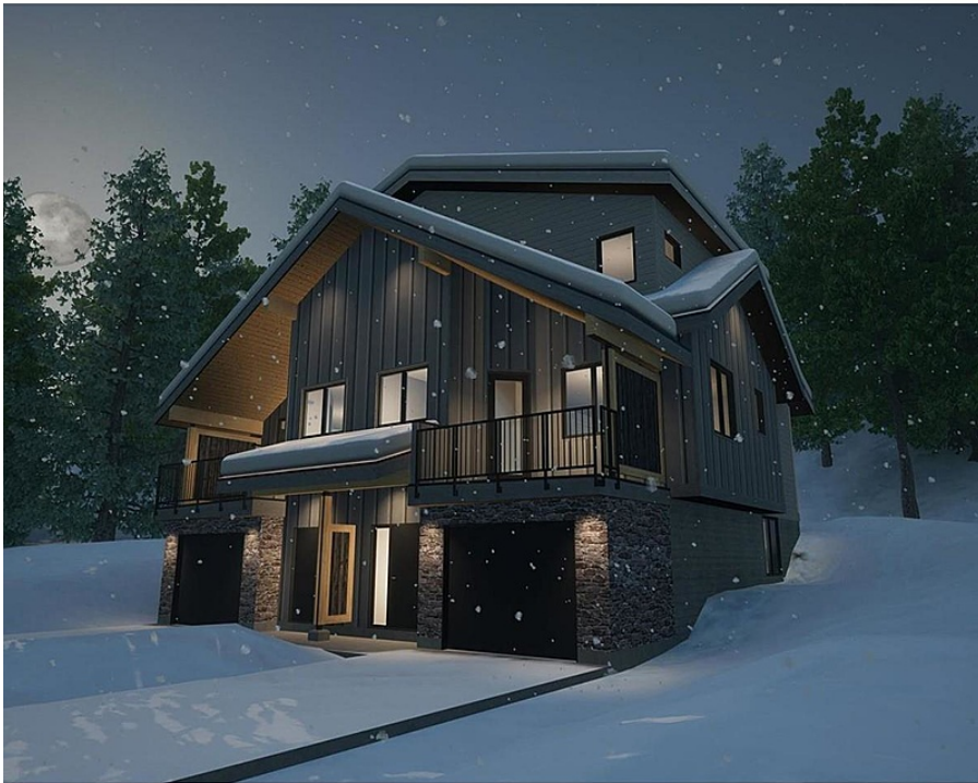
Floor plans, 3D models, and elevations are artist's renderings only, may not accurately represent the actual condition of a home and may contain options which are not standard on all designs. Acorn Communities LTD reserves the right to make modifications of equal or better value to plans, pricing, product design, specifications, fixtures, and features without prior notifications should necessary. E. & O.E.

Three Bedroom, Two Bath ski-in/ski-out home with a single car garage and ample driveway parking. Prioritize your savings with no strata fees. The main floor features an open living and dining area, leading to a balcony with space for a private hot tub installation and a modern kitchen for all your culinary needs. The top floor houses two additional bedrooms and convenient laundry. The master bedroom boasts a spacious walk-in closet. The Glades at Big White is an excellent investment opportunity with potential rental revenues of over $90,000. (id:56120)