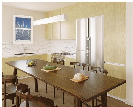
Floor plans, 3D models, and elevations are artist's renderings only, may not accurately represent the actual condition of a home and may contain options which are not standard on all designs. Acorn Communities LTD reserves the right to make modifications of equal or better value to plans, pricing, product design, specifications, fixtures, and features without prior notifications should necessary. E. & O.E.