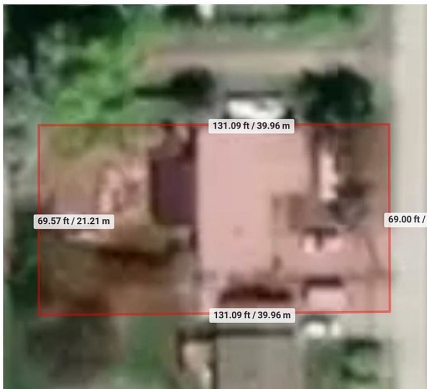
t Dimensions and Topography