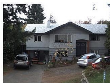
2644 SOOKE RD