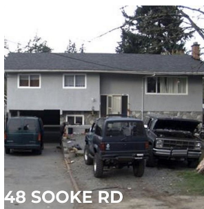
2648 SOOKE RD