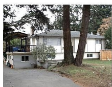
2640 SOOKE RD

Prime 4-Lot Land Assembly with Exceptional Potential for Developers! Located steps from the serene Glen Lake in Langford, this +/-33,100 square foot property currently has R2 zoning and presents a lucrative opportunity for rezoning to 2.5 FSR, ideal for constructing sought-after condos. Its strategic position offers unparalleled convenience, with essential amenities like Walmart, Superstore, Starbucks, Westshore Town Centre, Belmont Market, and Cineplex., ust a 5-minute drive away. Additionally, Costco and Highway 1 are within 10 minutes, enhancing its appeal for both residents and investors. Don't miss the chance to transform these four properties— 2640 Sooke Rd (MLS 950176), 2644 Sooke Rd (MLS 950177), 2648 Sooke Rd (MLS 950178), and 2652 Sooke Rd (MLS 950827)—As per the "OCP" there is the opportunity to build a thriving condominium, mixed-use and or office above retail store development. Act swiftly to seize this rare opportunity in Langford's dynamic real estate market! (id:56120)