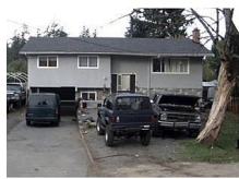
2648 SOOKE RD