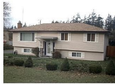
2652 SOOKE RD