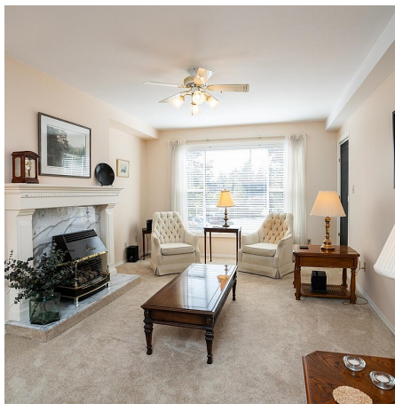
Living Area: 1698 sqft