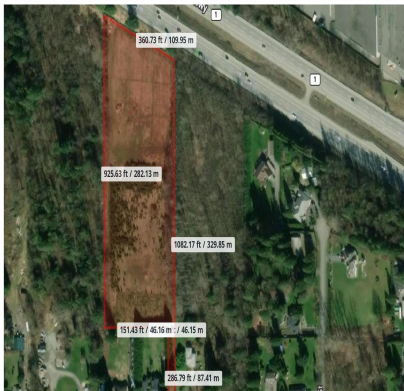
Estimated Lot Dimensions and Topography

The lot dimensions shown are estimated and should be verified by survey plan.