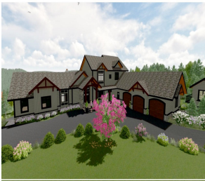
Front Lot 4 "D" 12041 Coughlin Court