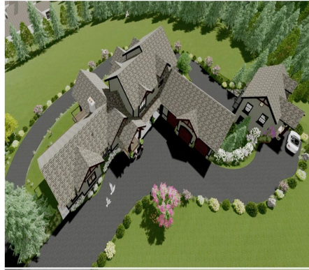
Drone View Lot 4 "D" 12041 Coughlin Court