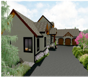
Front Lot 4 "D" 12041 Coughlin Court