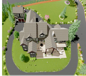
Back Drone Lot 4 "D" 12041 Coughlin Court