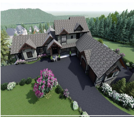
Front Lot 4 "D" 12041 Coughlin Court