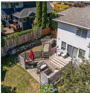
3R Inside Area 1055 R 2