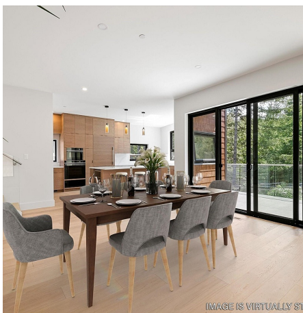
IMAGE IS VIRTUALLY STAGED