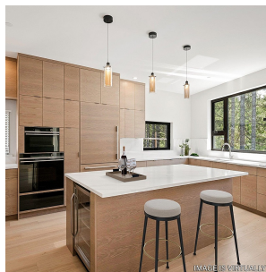
IMAGE IS VIRTUALLY STAGED