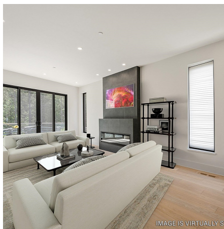
IMAGE IS VIRTUALLY STAGED