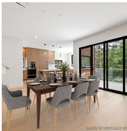
IMAGE IS VIRTUALLY STAGED