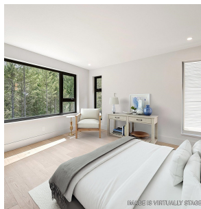
IMAGE IS VIRTUALLY STAGED